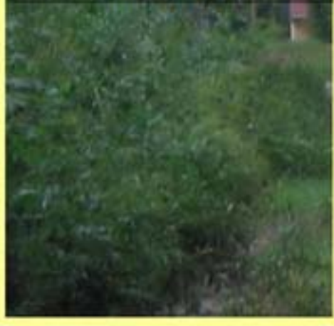
Litter and Debris